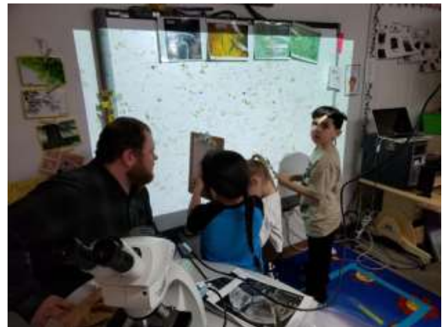
Students drawing pictures of soil microorganisms.